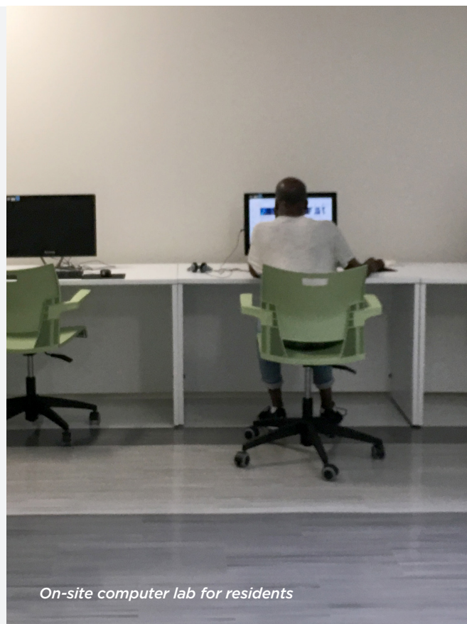
On-site computer lab for residents

Support from private foundations and government agencies is very important in allowing NYCEEC to work with and finance projects like Kenmore Hall. Contact us to learn how you can help NYCEEC in its work to create a clean energy future for all.